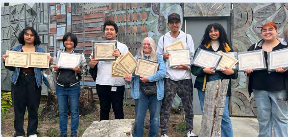
Los Medanos College journalism students with their awards.

To see the full list of awards visit the JACC website .